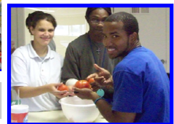
Job Corps Youth Enhance Job Skills