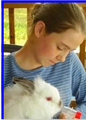
Workforce Preparation through 4-H Career Shadowing Program

22,463 youth & 1,942 volunteer$ were involved in project$, activitie$ & developing leader$hip $kill$ in the 4-H Youth Development program$ in the BRADD Di$trict.