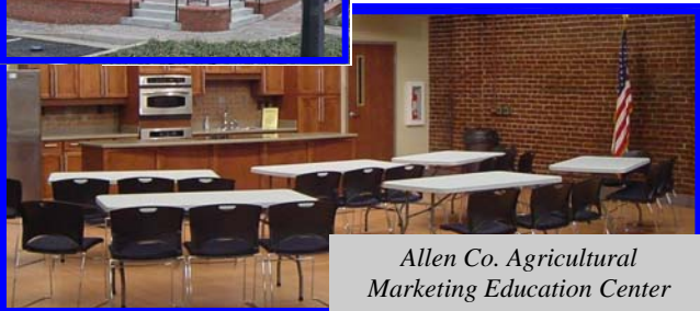
Allen Co. Agricultural Marketing Education Center

“As a result of Extension facilitated volunteer leadership 112,392 hours of community volunteer service, valued at $2,023,056.00, were contributed toward improving quality life in the ten county area!”