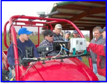
Adopting GPS Technology Workshop in Butler County