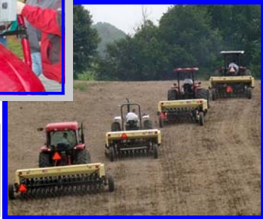
Forage Improvement Program in Monroe Co. Supported by Ag Development Funds