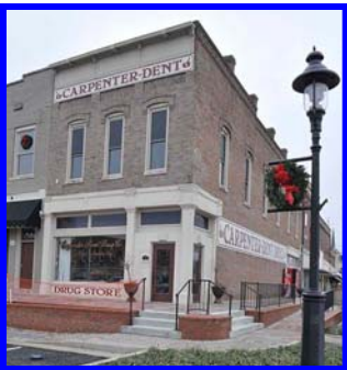
Scottsville Main Street Program Streetscape Project & Renaissance Building Renovations- $565,000 in TEA-21, Renaissance & Private Foundation Funding