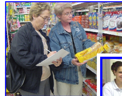
Allen County Homemakers Practice Wise Shopping